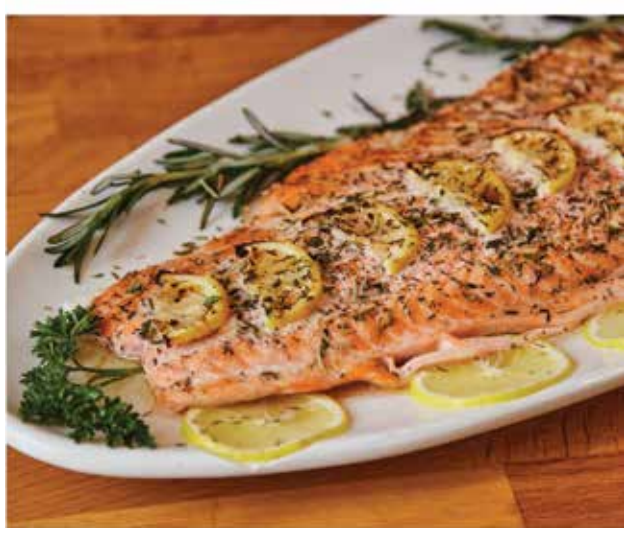
*Consuming raw or undercooked meats, poultry, seafood, shellfish or eggs may increase your risk of foodborne illness.